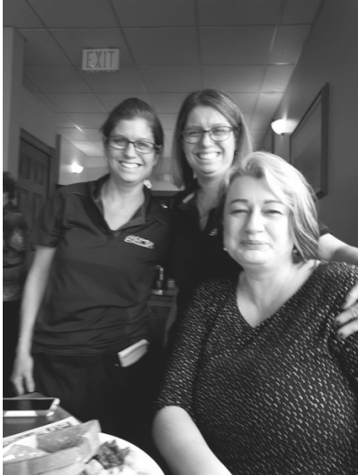
Great visit with the folks at Sams Restaurant on St. Peter's Rd.

Legislature update: QP - Microloans, Gender Balance in Agencies, Boards and Commissions. Bill 112 - Conflict of Interest Act and a Member's Statement on Hamby's RV Furnishings and Quality Homes 40th Anniversary.